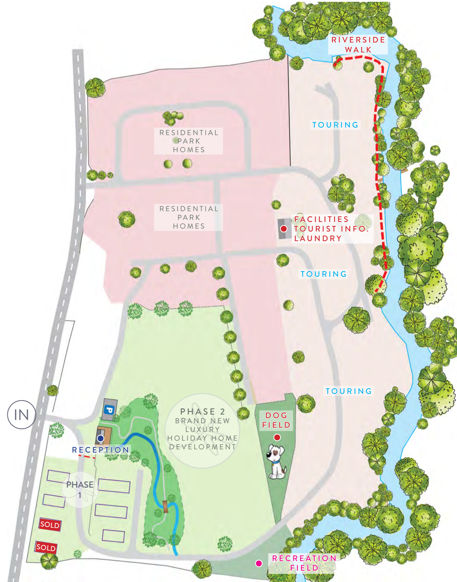
THE RETREAT - PHASE 2 BRAND NEW LUXURY HOLIDAY HOME DEVELOPMENT