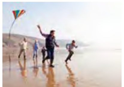
ALL images used are for illustrative purposes only