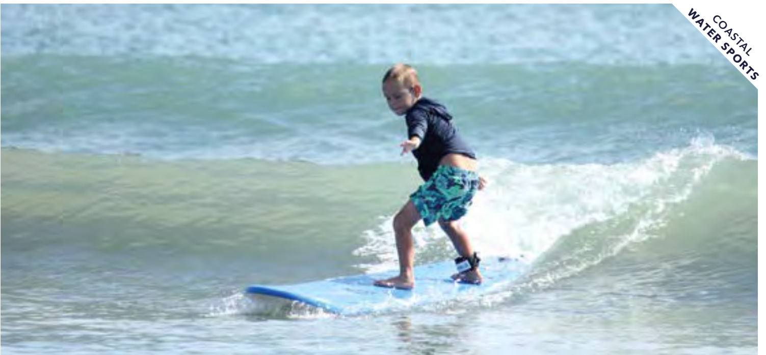
COASTAL WATER SPORTS