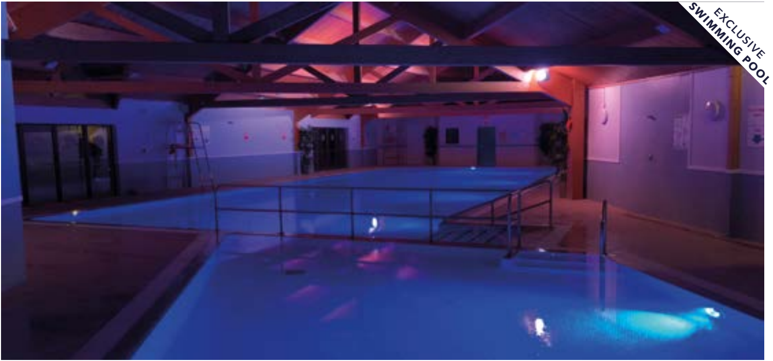
EXCLUSIVE SWIMMING POOL